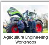
Agriculture Engineering Workshops