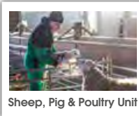
Sheep, Pig & Poultry Unit