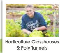
Horticulture Glasshouses & Poly Tunnels