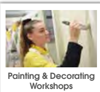
Painting & Decorating Workshops